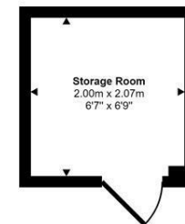
Storage Room Approx 4 sq m / 45 sq ft